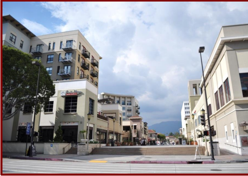
Paseo Colorado – Mall